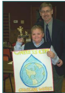
1st Place Winner

The Fayette County Soil & Water Conservation District held its 63 rd Annual Meeting on Thursday, February 21 st at the American Legion Hall in Vandalia. We had 80 people in attendance this year.