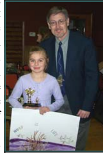
2nd Place Winner