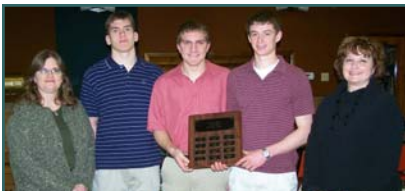
Vandalia Envirothon Team and Advisor receive award